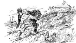
THE WHITE MAN'S BURDEN — The Journal, Detroit . From The Detroit Journal , February 18, 1899