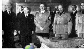
or Rare Speech